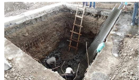
FOUNDATION WORK FOR PRESS MACHINE IN MASO II