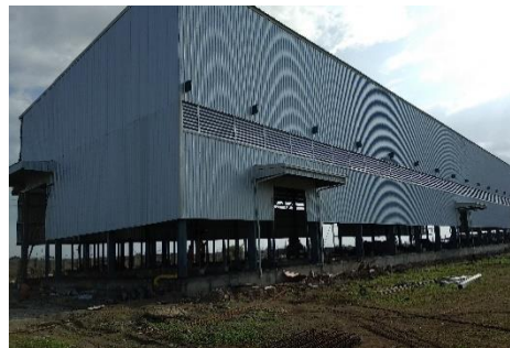
MASO II SHED