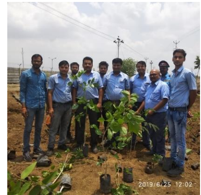
MIYAWAKI PLANTATION IN MASCOR