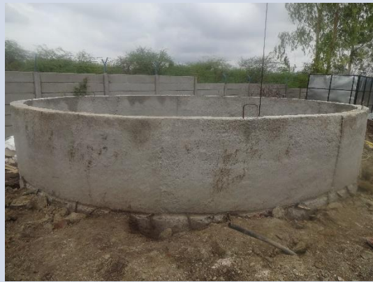
WELL AFTER CONSTRUCTION