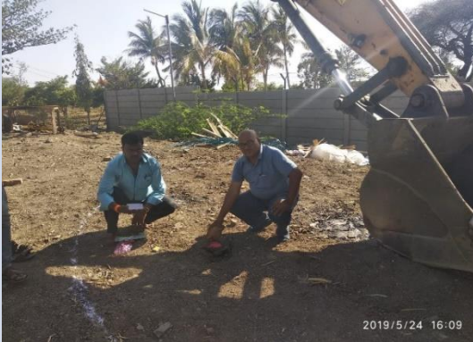
BHOOMI PUJAN AT THE WELL SITE

DFPL has dug wells in its premises in order to harvest rain water. This water will be used in future for direct use or for can be recharged in to the ground.